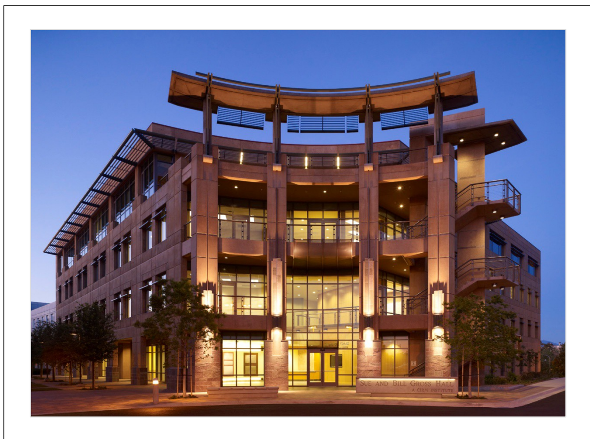
Sue & Bill Gross Stem Cell Laboratory

The features summarized above were applied in UC Irvine's first "smart lab" project, completed in 2010: