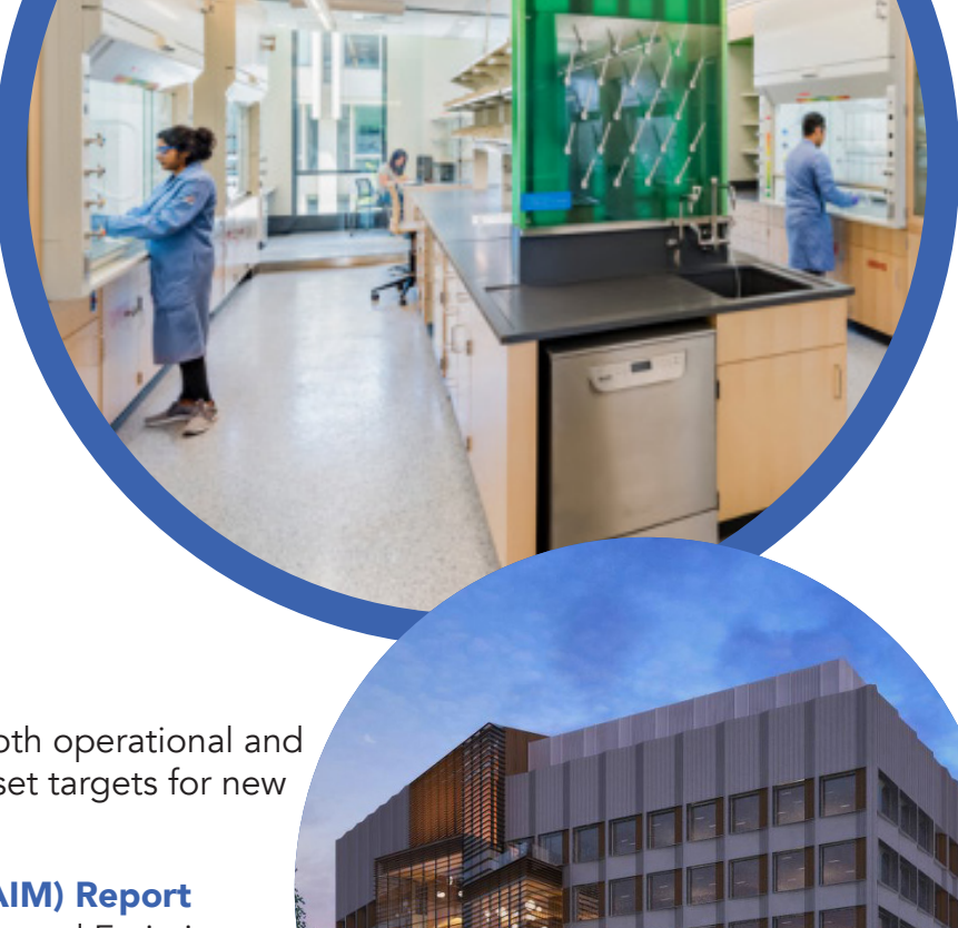
Alexandria Real Estate Equities, Cambridge, Massachusetts