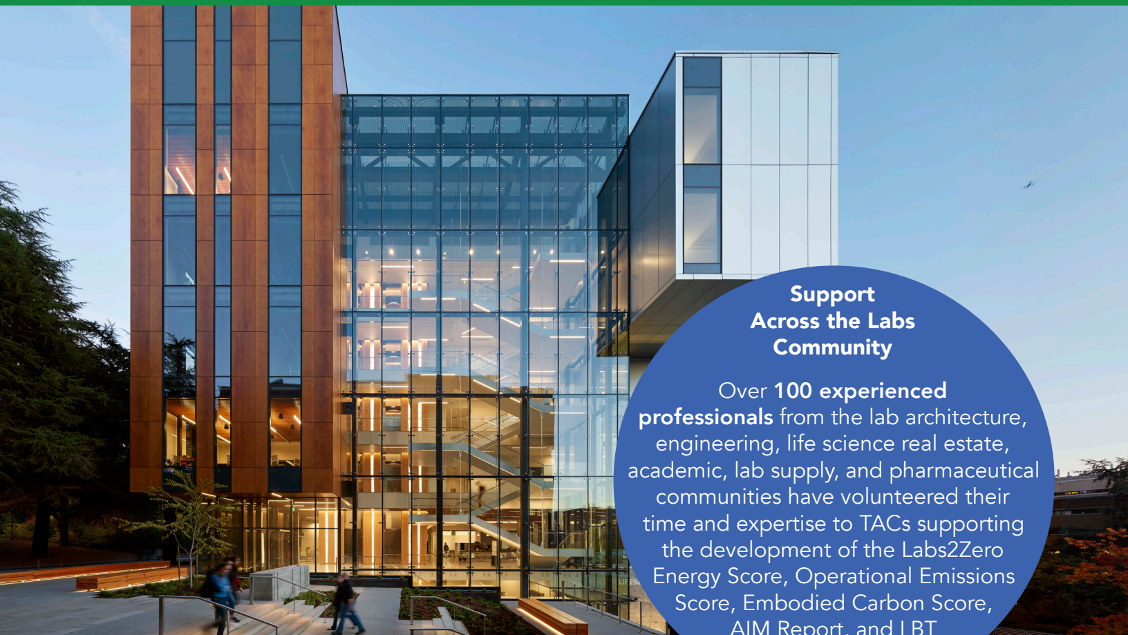
University of Washington Life Sciences Building, Seattle, Washington