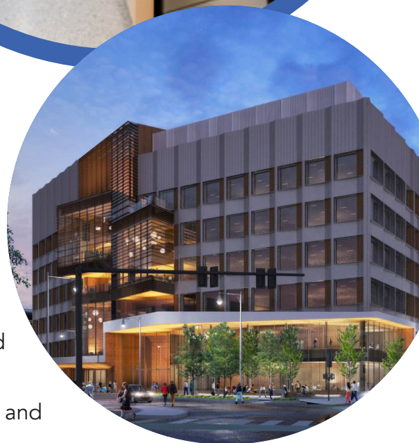
Alexandria Real Estate Equities, Cambridge, Massachusetts